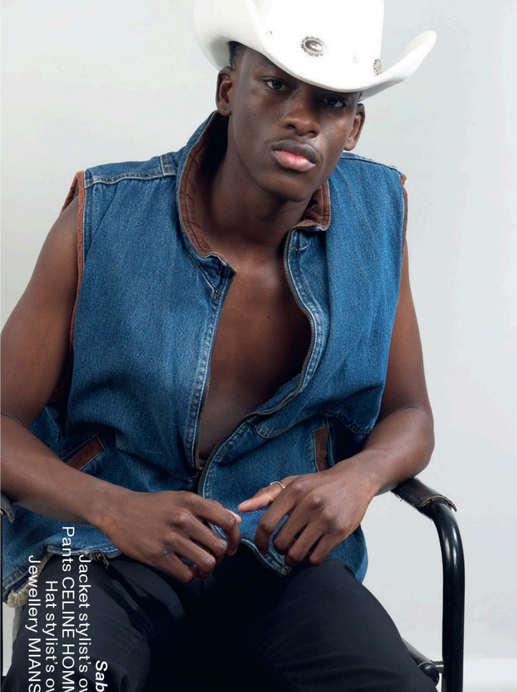
Sabb Jacket stylist's own Pants CELINE HOMM Hat stylist's own Jewellery MIANS