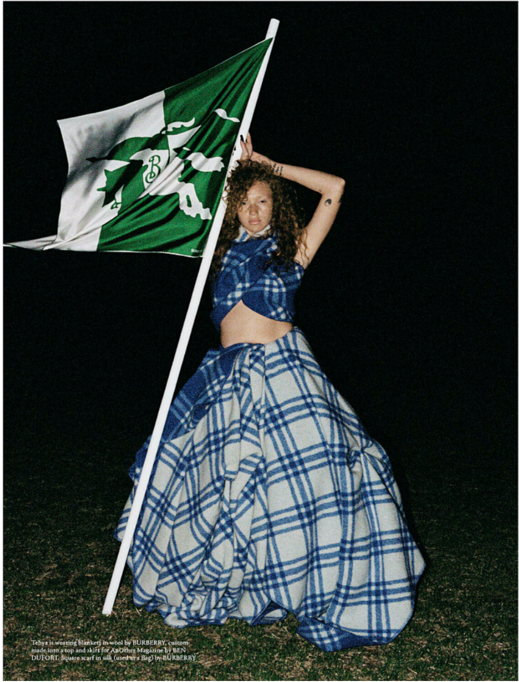
Tehya is wearing Blinkers in wool by BURBERRY, custom-made into a top and skirt for AnOther Magazine by BEN DUFORT. Square scarf in silk (used as a bag) by BURBERRY